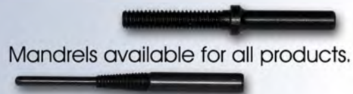
Mandrels available for all products.