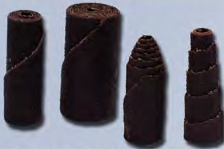
Straight and Tapered (also available in S/C & Zirc)

Cartridge rolls are available in many sizes and grits designed for continuous cutting action for your hard to reach places.